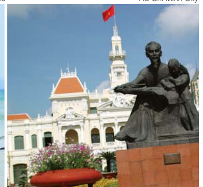
Ho Chi Minh City

Ho Chi Minh City ▶ Mekong Delta ▶ Phu Quoc